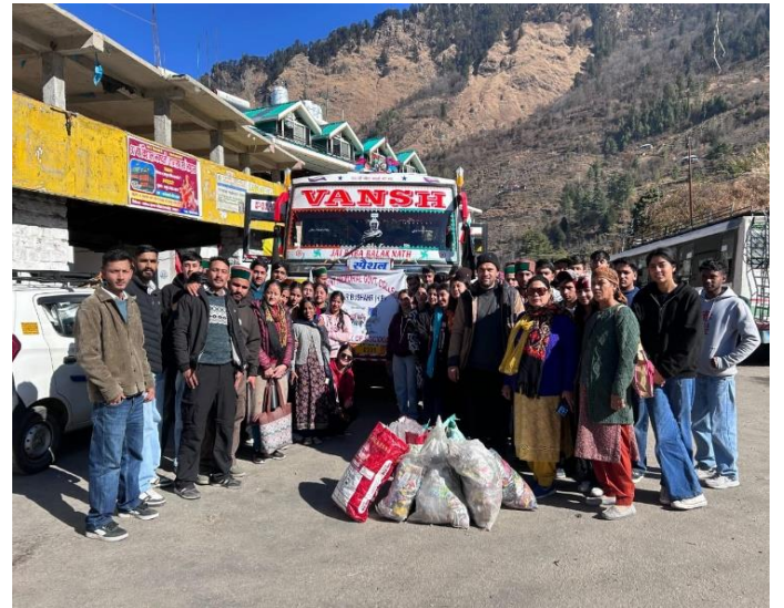
(Cleanliness Drive at Sarahan)